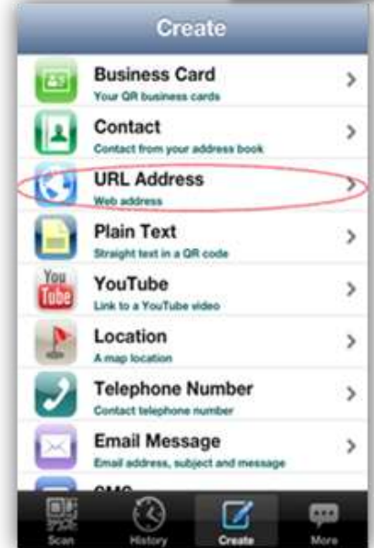
QR Droid (Android)