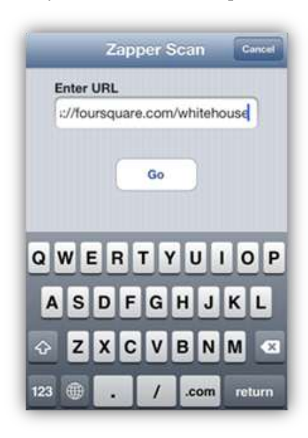
Zapper Scanner (iOS)