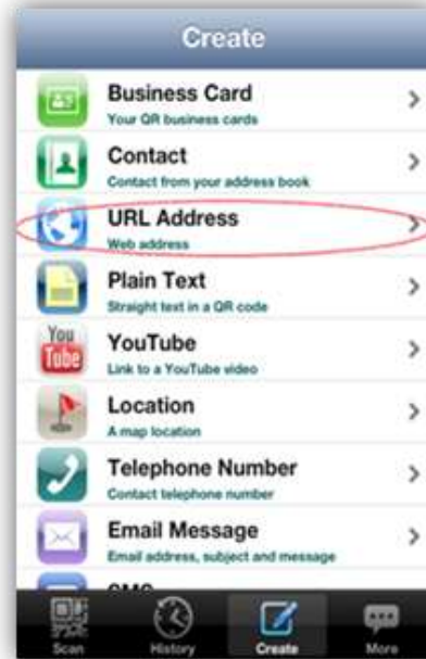
Zapper Scanner (iOS)