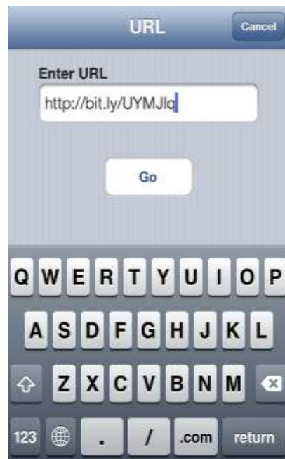
Zapper Scanner (iOS)