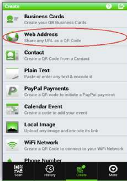
QR Droid (Android)