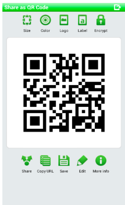
QR Droid (Android)

4. Here's the resulting QR Code shown on each platform: