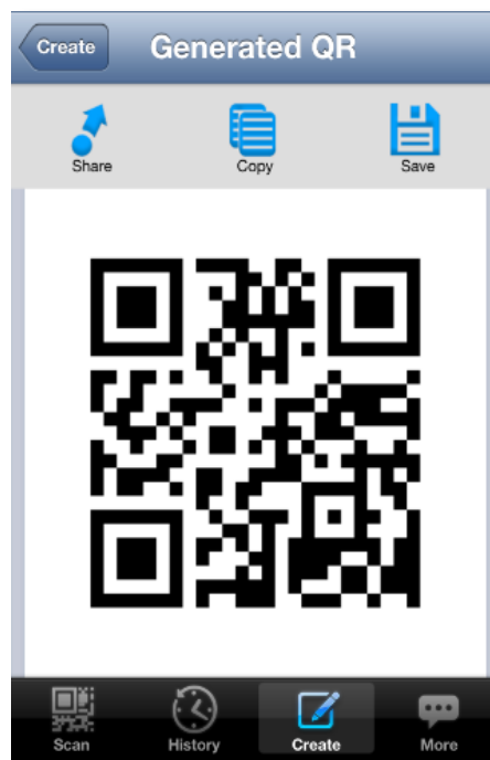
Zapper Scanner (iOS)

Create a Standout Mobile-friendly Landing Page: Remember that QR Codes are primarily scanned with a mobile device, so mobile-optimizing your e-newsletter's landing page is critical. (source— Search Engine Watch ) :