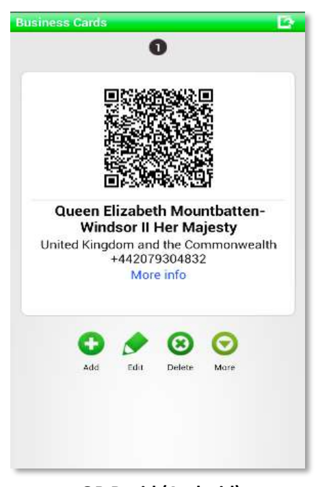
QR Droid (Android)

Device screenshots (Queen's contact-type QR Code output):