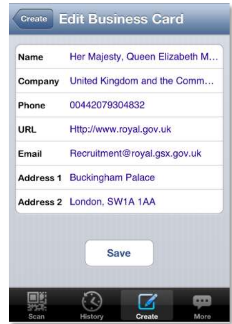
QR Droid (Android)